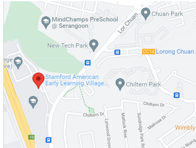
Early Learning Village: 3 Chuan Lane, Gate 4, Singapore 554350