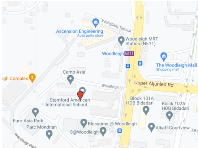
Woodleigh Campus: 1 Woodleigh Lane (Off Upper Serangoon Road), Singapore 357684

International students from more than 77 countries learn together at Stamford American's stunning, bespoke campuses. Located just 10 minutes from popular Orchard Road, the Woodleigh Campus and Chuan Lane Campus welcome students from infant care to Grade 12. The campuses are conveniently linked by a shuttle bus service, making their unique facilities accessible to both parents and students.