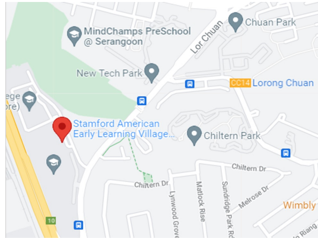
Early Learning Village: 3 Chuan Lane, Gate 4, Singapore 554350