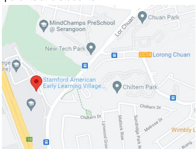
Early Learning Village: 3 Chuan Lane, Gate 4, Singapore 554350

Woodleigh Campus: 1 Woodleigh Lane (Off Upper Serangoon Road), Singapore 357684